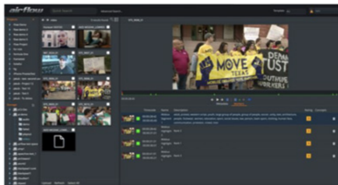
Triggers can be set up for media to be scanned and sent for processing

Using FLOW Automation, triggers can be set up for media to be scanned and sent for processing by the various installed AI services. Media will be analyzed and matching metadata is then sent back to FLOW for inclusion in the reference database. This media can be easily searched in FLOW and panel applications making locating relevant assets quick and accurate.