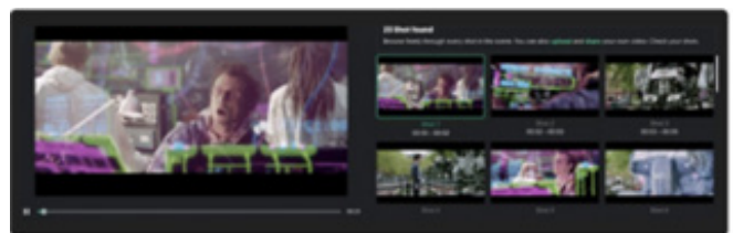
Identify and automatically segment shots

Identifies and segments shots within video content, enabling users to have a more structured access to their media.