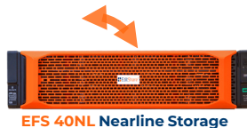
EFS 40NL Nearline Storage

Save on higher-value online storage by automating move to & from lower-cost HDD nearline.